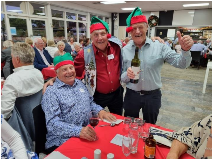
The three wise men