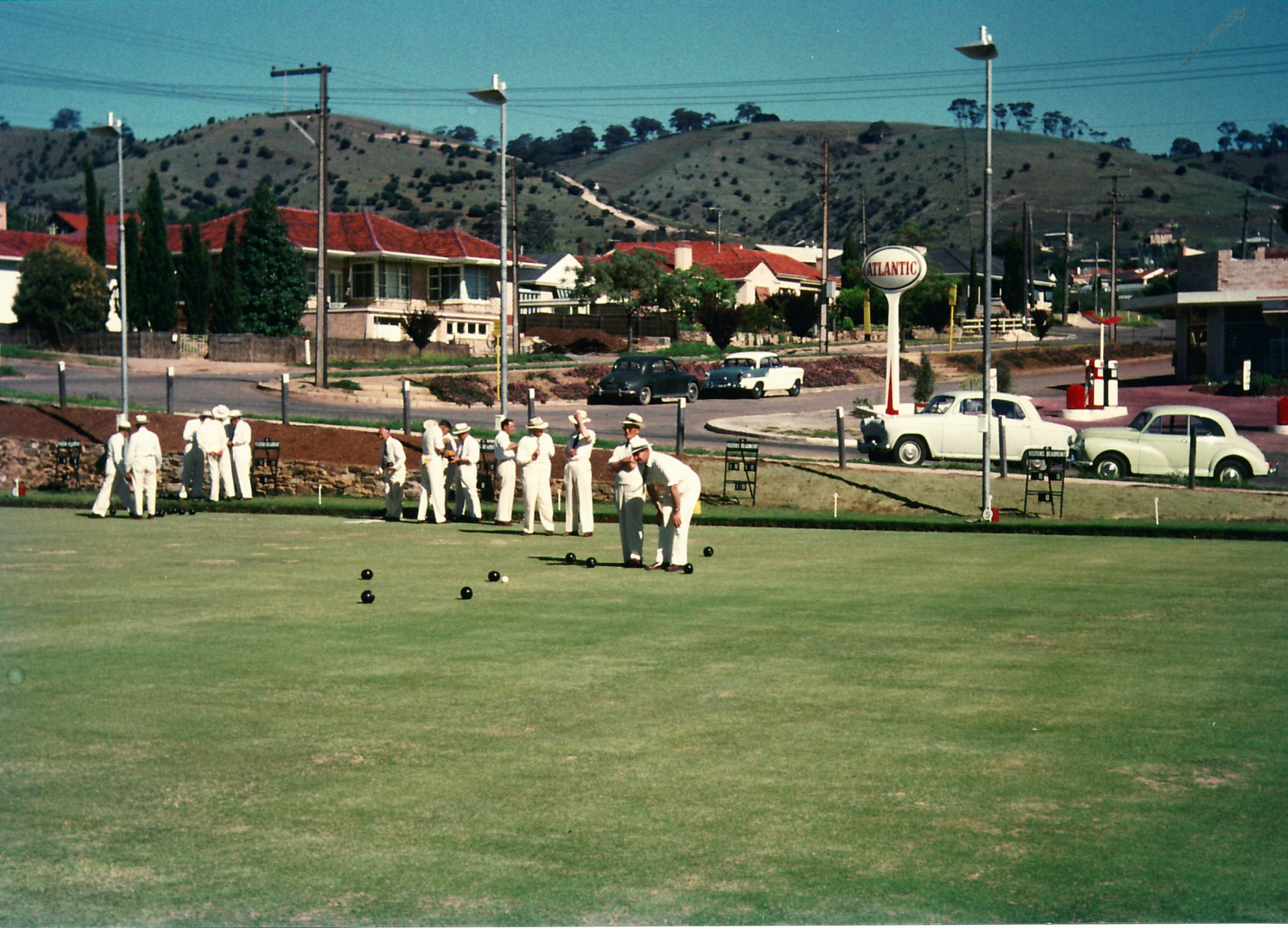
"A" Green in the late 50's. Note the cars, Atlantic Fuel sign & the lack of houses on the hills face in the back ground.