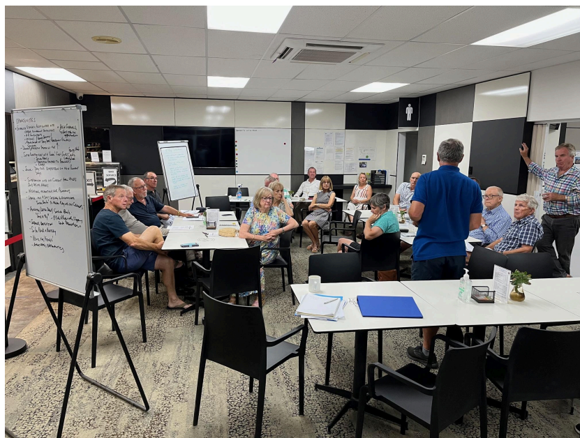
The SWOT crew hard at it